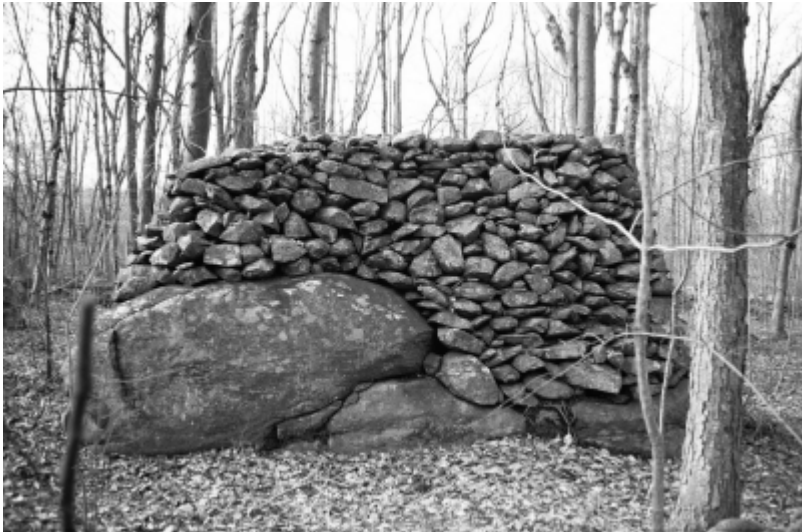
Pre-Columbian Stonework at the Oley Hills site in Berks County, Pennsylvania